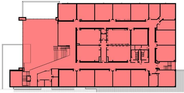
SECOND FLOOR- (FRESHMAN CENTER)