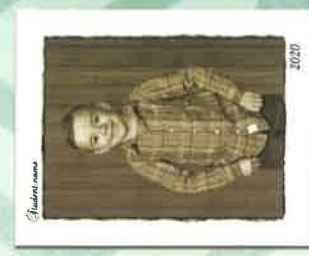
Timeless 8x10 (printed in black and white only)