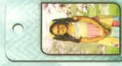
Key Fob (set of 3)